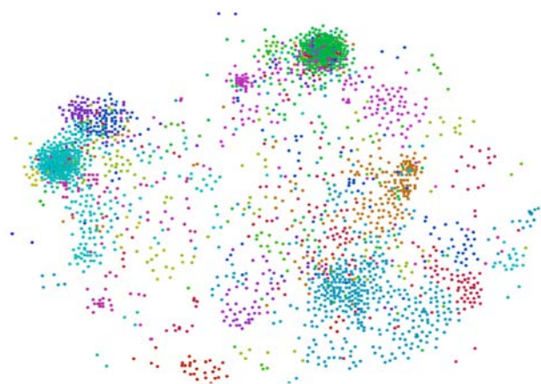
FIGURE 1. Force-directed visualization.

ed to the university is confirmed. As shown clearly in graph 1, there is a very significant gap between the number of men and women who appear in news related to the university. The situation began to improve, albeit slowly, from the end of the 1990s, but there is still a wide gap. Secondly, we observe that the women who appear in uni-