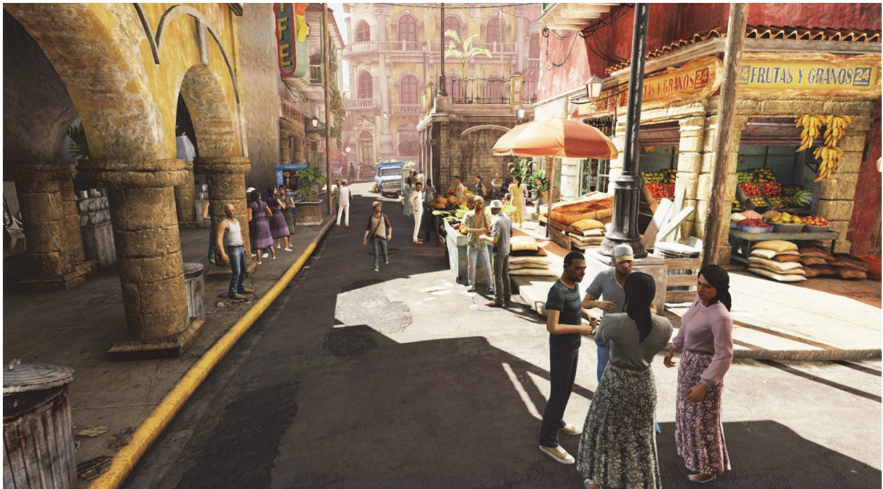
FIGURE 6. Commercial street environment in Cartagena. Uncharted 3: Drake's Deception .

element in the space, since they have a settled symbolic value, locating the player in the urban landscape immediately. (See Fig. 7).