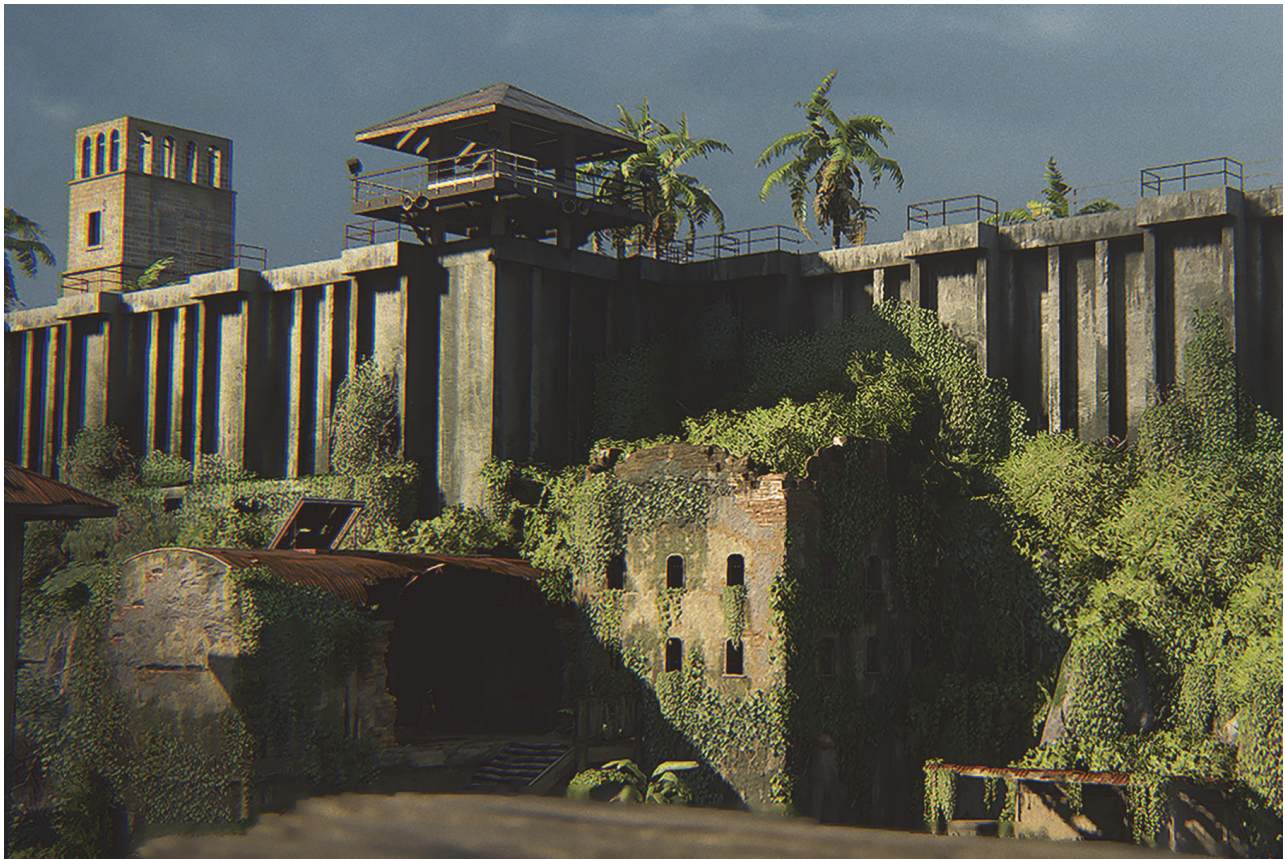
FIGURE 13. Panamá Prison. In this case, the building is in the paradisiac natural place, no urban scenarios and the materiality is conceived as a military Latin American massive and decadent facility. Videogame: Uncharted 4: A Thief's End .

In the Madagascar scenes, like those in Latin America, depictions of formal and informal businesses can be observed. At the beginning of Chapter 11 , Drake traverses a space that is a Madagascan or informal market plaza. It is full of small stands carried by “natives” and covered each with a parasol. In the shops, fruits and meats are sold. Eventually, the player’s path is blocked by saleswomen who approach him and persuade him to buy an apple. Drake wonders how prolific and artisanal the apple crops in Madagascar are, in such a way that street vendors have them as their primary commodity. Informal markets are in a physical state of decay. The health conditions represented are not standard; there are puddles of dirty water next to shops that sell food. The local’s tents follow a uniform pattern: either a parasol covers them, or they are made up of wood and brass walls that do not vary much between them, suggesting that they are thought through ‘type’ objects that can be used to represent any trade of the place. However, formal trades in Madagascar are also described in this chapter. The dock is presented where large amounts of imports arrive or large quantities of exports depart. It is necessary to think that if the city is not Antananarivo, how coherent these dimensions are with the real maritime trade of Madagascar. (See Fig. 14)