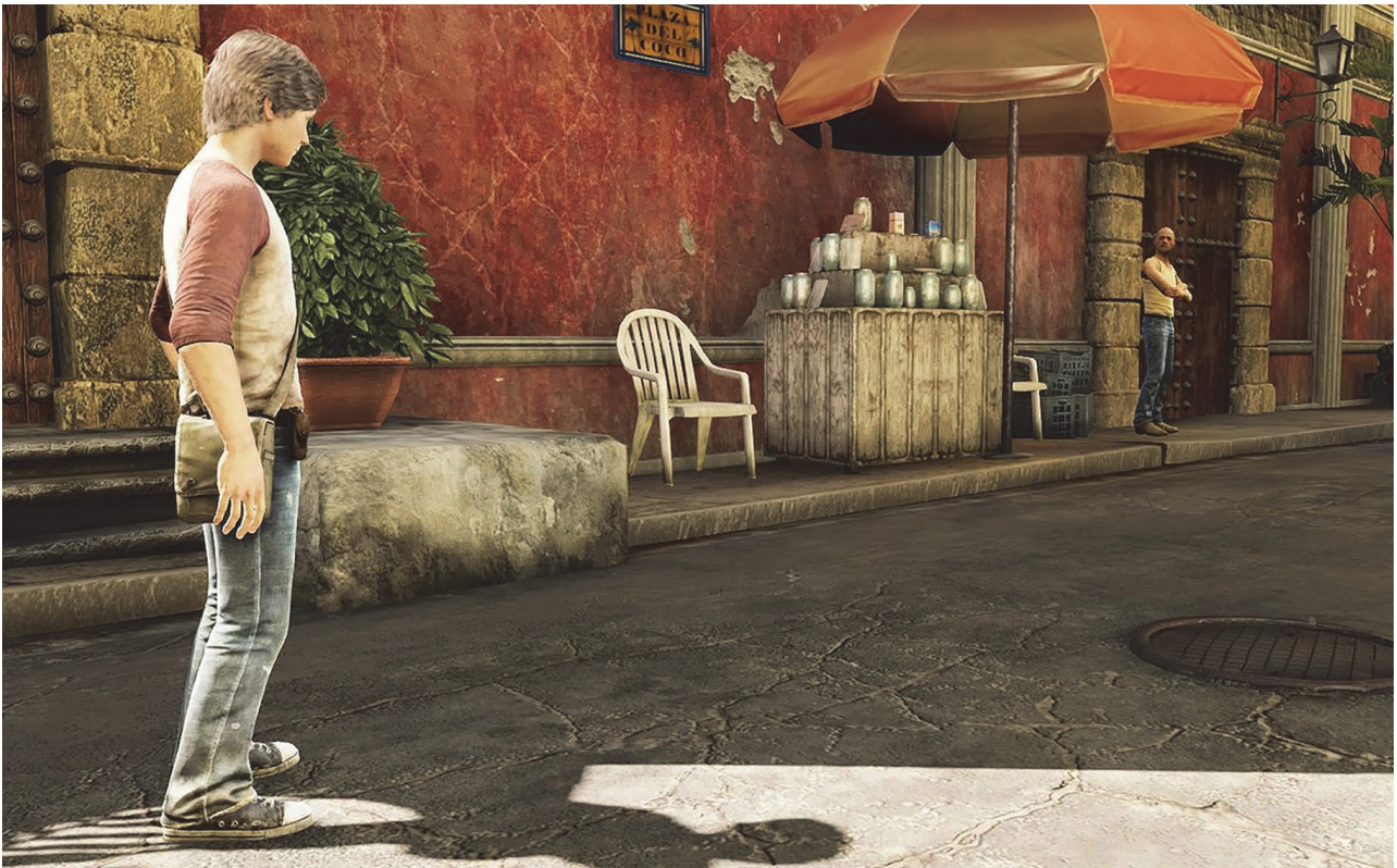
FIGURE 4. Screenshot of Cartagena in Uncharted 3: Drake's Deception .