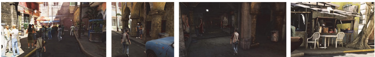
FIGURE 7. From left: Screenshots in Chapter 2: Uncharted 3: Drake's Deception analyzing the sequences of images and the exploration of the consumption spaces and objects related.

Advertising is part of the urban landscape and allows cities to generate new messages, knowledge, and interre-