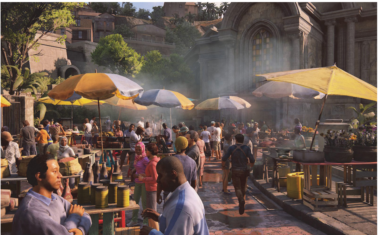
FIGURE 5. Screenshot of the walkthrough Madagascar market mission in Uncharted 4: A Thief's End .