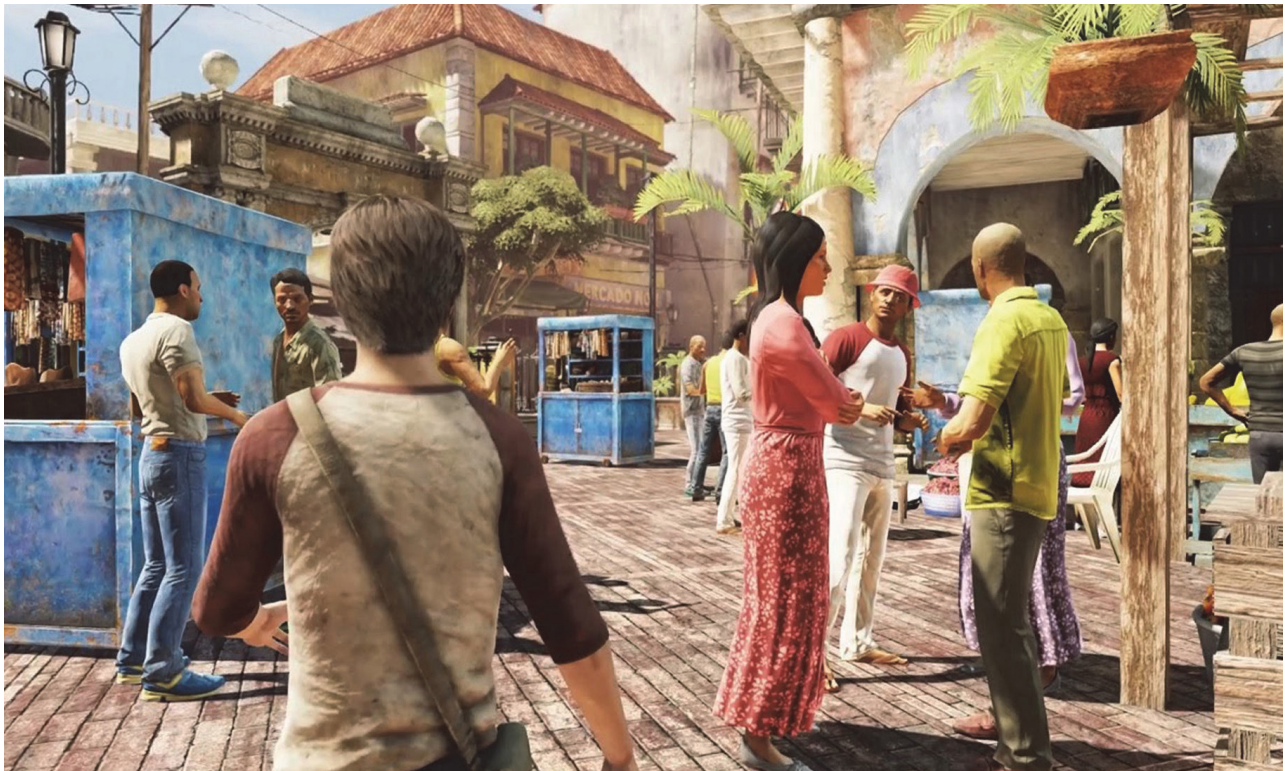
FIGURE 10. Screenshot of interaction in Plaza de la Habana (Aduana) in Uncharted 3: Drake's Deception .

the modification of the room in the 20th century, to serve as a shelter for the first infantry battalion of the Colombian Navy.