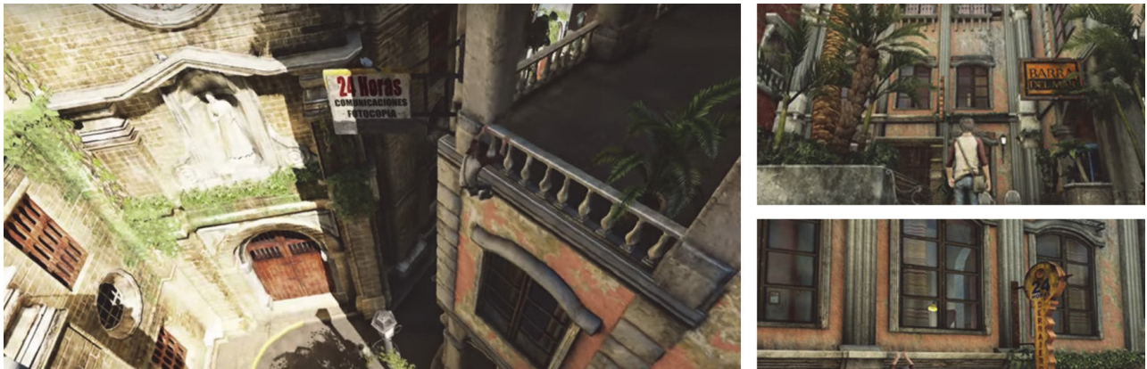
FIGURE 9. Left: The superimposition of the mixed church/photocopies centre, reflects how advertising as a commercial method helps establishes a stereoscape . Right Top: Another example of a mixture of advertising as a playable object. Right Bottom: The key cutting centre mixed with a historic building.