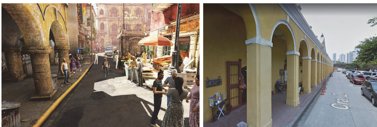
FIGURE 11. Comparative exercise of the representation in the videogame Uncharted 3: Drake's Deception . In the left, a screenshot in the walkthrough from the semi-open map of Cartagena; on the right, a virtual screenshot from Google street view (accessed Jul/2018), in the Bulwark of Santa Catalina.