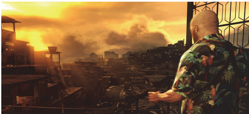
FIGURE 3. From top to bottom: (1) Rio de Janeiro Portraited in Papo y Yo (Minority Media Inc, 2012); (2) Rio de Janeiro represented in Call of Duty: Black Ops (Treyarch - Activision, 2010); (3) Sao Paolo favelas in Max Payne 3 (Rockstar Games, 2012).