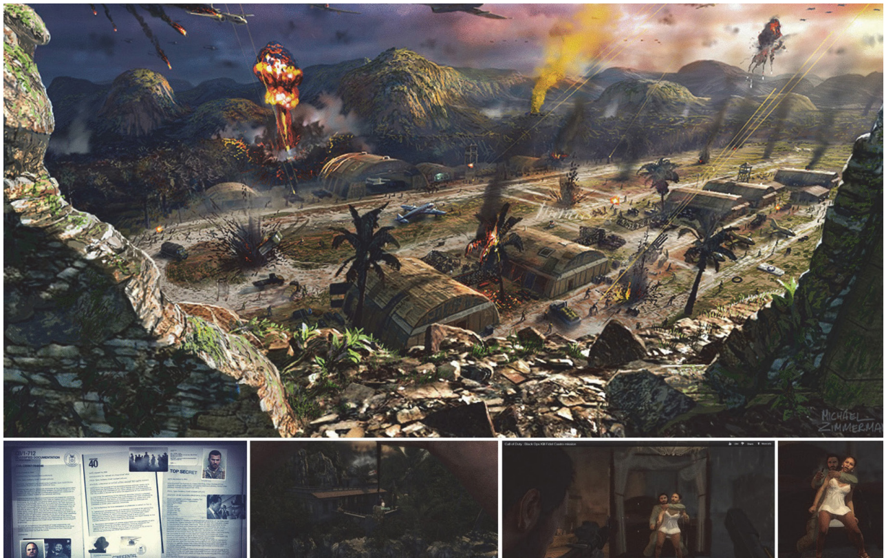
FIGURE 1. TOP: (1) Aerial image of the geographical context in which operation 40 takes place: Bahía de Cochinos, Cuba; within the game CoD: BO. The image shows a landscape characteristic of the Pinar del Rio Province and not the real place (Bay of Pigs). However, it works to recreate its natural features and its topographic condition. DOWN: (From Left to Right) (2) The brief of the mission with conceptual elements: photographs and a description of the place where the mission will be carried out. (3) The entrance to the presidential house of Fidel Castro, which according to the game is presented as a mansion in the middle of a remote and high mountain. (4) / (5) The showdown scene of this mission. However, the exciting part of the action here is the stereotypical representation of the Latin American woman (Cuban in this case), because of her sexualized body image, but also because of her dress.

Representations of Latin America in popular culture of the 20th and 21st centuries have been conceived through stereotypes (Roman, 2000), and videogames are no exception. Researchers have already considered the stereotypical categories under which Latin America has been portrayed. From Pitfall! (David Crane -Activision, 1982), the first game that happened within a 2D linear 8bits Latin American scenario, to Call of Duty: Black Ops (Treyarch - Activision, 2010) (See Fig. 1), a game that in