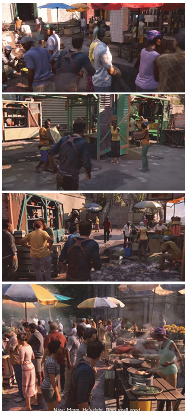
FIGURE 14. Collection of images (screenshot) in the Madagascar market interactions in the videogame: Uncharted 4: A Thief's End .

that is built in these scenarios. However, the discussion and debate between different members of the group deepened to have a transdisciplinary discussion, engaging other readings always in the confrontation and use of the videogame as a ludic and learning tool.