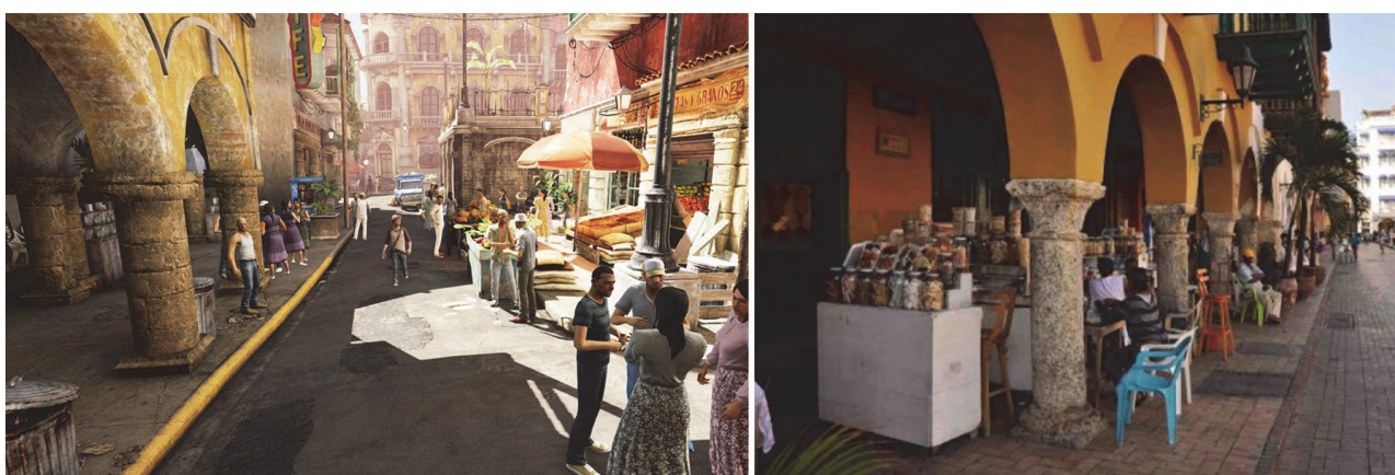
FIGURE 12. Comparative exercise of the representation in the videogame Uncharted 3: Drake's Deception . In the left, a screenshot in the walkthrough from the semi-open map of Cartagena; on the right, a virtual screenshot from Google street view (accessed Jul/2018), in the Portal de Los Dulces .