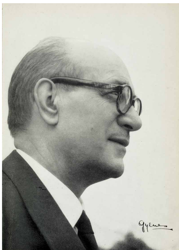
Figure 1. José Ibáñez Martín’s portrait in a special issue in his honour in the journal Arbor. Arbor, 1970, 289, p. 8.

hostility, Ibáñez Martín stressed the Christian aspect of the Movimiento and the aim to transform Spain into the spiritual reserve of the West—“ la reserva espiritual de Occidente ” (Ibáñez Martín, 1942). Matter, life and spirit constituted the three pillars of the CSIC, the three branches of the Arbor Scientiae , and the ideal balance of that new totalitarian science (Ibáñez Martín, 1942: 22; 1950). Democracy and liberalism weakened the state, whereas, in his view, unity among several basic principles – religion, Hispanidad, hierarchy, obedience, nationalism and morality – from his totalitarian view– strengthened it. In his words: