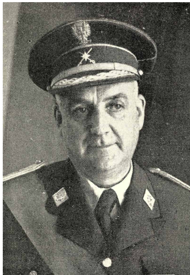
Figure 3. José María Fernández Ladreda, as he appeared in Ión , 1945, 49(5), p. 415. Author's private collection.