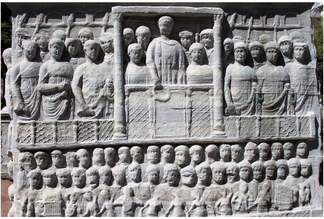
FIGURE 1. Relief from the obelisk base of Theodosios I, East. Hippodrome, Istanbul.

When all was quiet the happy people decorated the holy walls throughout the city by garlanding the buildings... They decorated the doorposts and adorned the thresholds with reeds, and stretched festive covering in all the streets. Then the young men began to make merry and add praises to praises; they applauded with their feet, and stepped out in sweet steps and made new songs with wonderful tunes.<sup>43</sup>