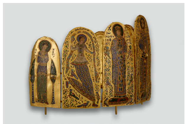
FIGURE 2. "Dancing-girl" enamel panel of the Monomachos Crown. Hungarian National Museum, Budapest.

Images that visualise dancing as part of a victory procession illustrate David's entry into Jerusalem after his defeat of Goliath (I Kings 18.6-7) on the ninth-century ivory box now housed in the Palazzo Venezia in Rome, in the ninth-century Sacra Parallela, and in the eleventh-century Vatican Book of Kings (Fig. 3).<sup>59</sup> In the latter, the dancers are arranged in a circle welcoming David on his return, an image that finds an echo in the miniature accompanying Psalm 151.6-7, a passage celebrating the victory over Goliath, in the (also eleventh-century) Vatican Psalter (BAV gr.752, f.449v: Fig. 4), though here the dance of Miriam is also referenced (see below).<sup>60</sup> A dancer also appears in this context in the tenth-century Paris Psalter, and musicians (but no separate dancer) in the eleventh-century Theodore Psalter.<sup>61</sup> The late Byzantine pyxis now at Dumbarton Oaks, which shows a dancer and musicians entertaining the imperial family translates this Davidic theme into contemporary politics.<sup>62</sup>