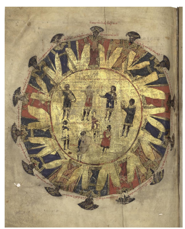
FIGURE 4. The Dance of the Women of Israel and Miriam. Vatican Psalter, Vat.gr.752, f.449v.