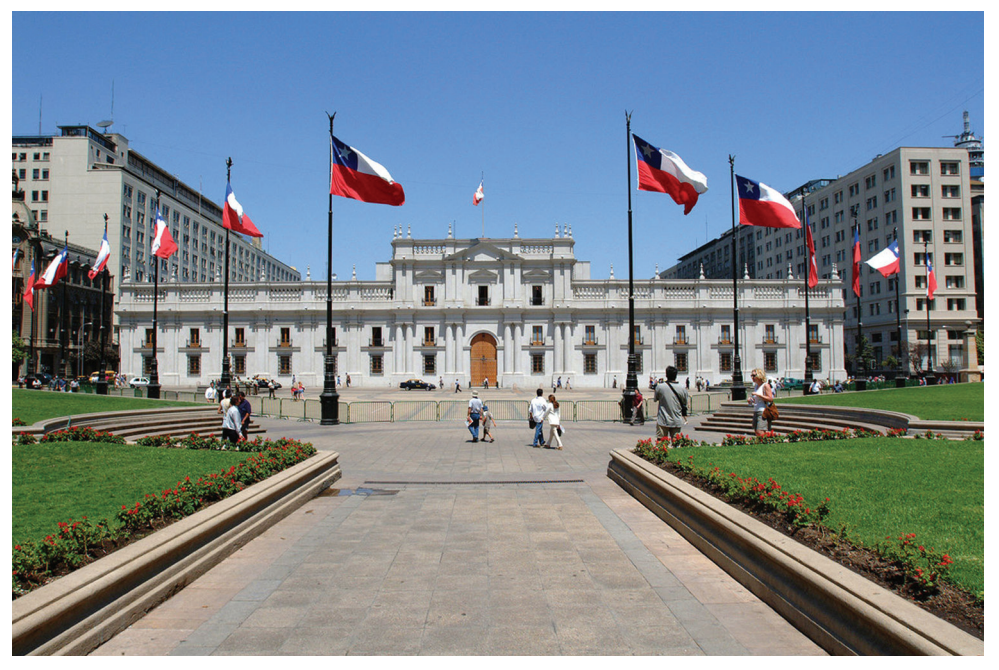
FIGURE 1: La Moneda palace, viewed from Plaza de la Constitución (2012). Author: Ministerio Secretaría General de Gobierno. Source: Wikimedia Commons [CC-BY-2.0]

The first example is La Moneda Palace, the traditional House of Government (Fig. 1). Besides being the most renowned historical monument of national heritage, declared as such in 1951, La Moneda is also the physical site of one of the most emblematic scenes of the 1973 military coup. On September 11<sup>th</sup> of that year, the building was bombed by the Chilean Air Force, leaving parts of it on fire and its ceiling collapsed. This powerful and terrifying image put into evidence the military's radical will. The military destroyed the most prominent symbol of the state, with the clear intention of eliminating those people who were inside, first and foremost the president of La