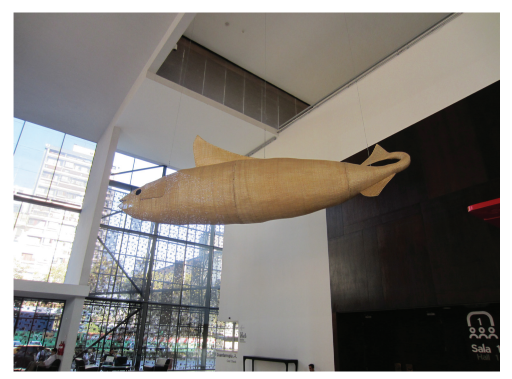
FIGURE 6: One of the art works of the patrimonial collection of GAM Cultural Center. It is a reproduction of an original piece that was lost after 1973. The reproduction has now been installed in the main entrance to the building (April 2013)

Nevertheless, the new identity of this place also required specific selections. Similar to La Moneda , there is nothing here that is a reminder of the Diego Portales building, nor of the 1973 coup. Among the pieces in-