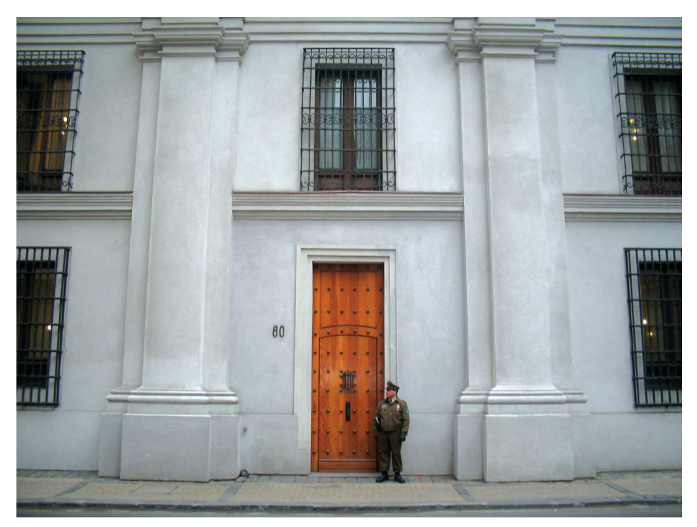
FIGURE 2: Morandé 80 door, on the Eastern side of the palace (2007).

According to this approach, the small hall derived from the construction of Morandé 80 was transformed into what the tourist guides at the palace normally call the "Memorial of the Republic". It contains certain symbols of the "Republican traditions" to which it is devoted: among them, the collection of presidential coins and a manuscript from 1818 that is a draft of the Declaration of Independence, signed by Bernardo O'Higgins, Chile's Libertador . Again, there is nothing here that specifically relates to September 11<sup>th</sup>, 1973. The draft of the Independence Act is only a draft, because the official document was lost in the bombing of 1973; however, this detail has not been recorded in the "Memorial of the Republic". Among the presidential coins displayed there, the symbol of Pinochet's government is absent, not be-