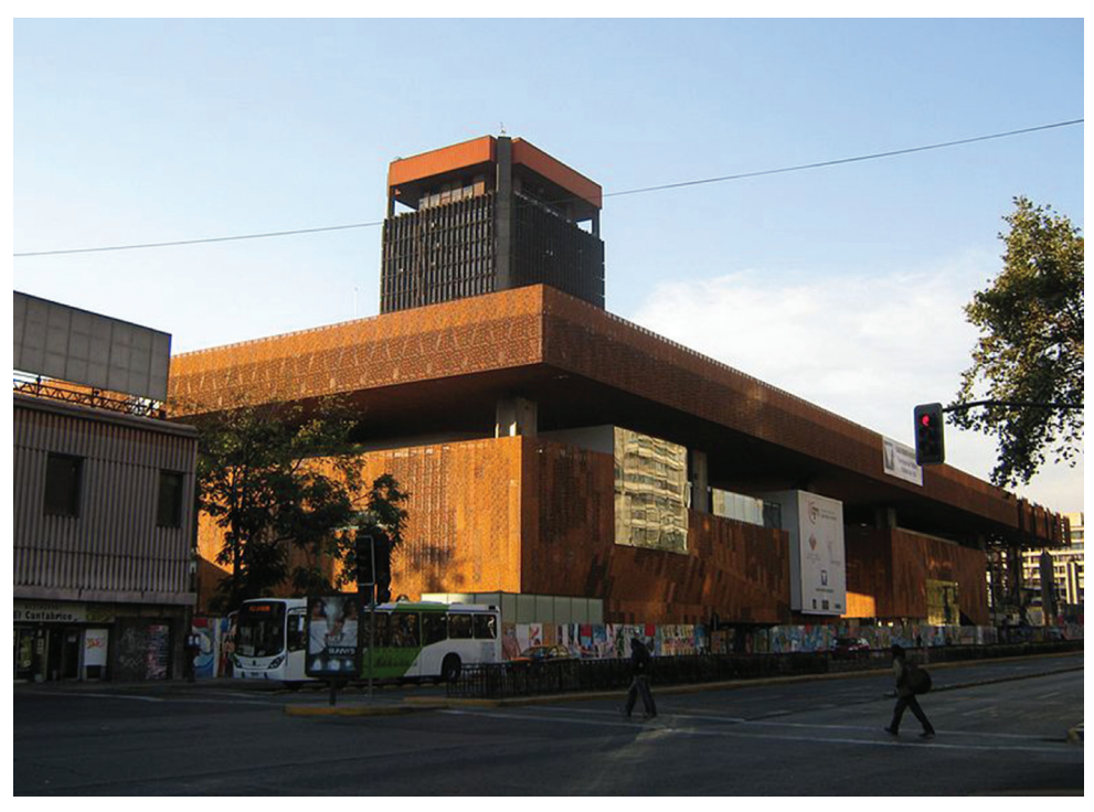
FIGURE 5: GAM Cultural Center (2010). The picture shows the two buildings -the tower and the main rectangular construction- that together form the complex. Author: Penarc. Source: Wikimedia Commons [CC-BY-SA-3.0]

When memory becomes heritage: Experiences from Santiago, Chile • 13