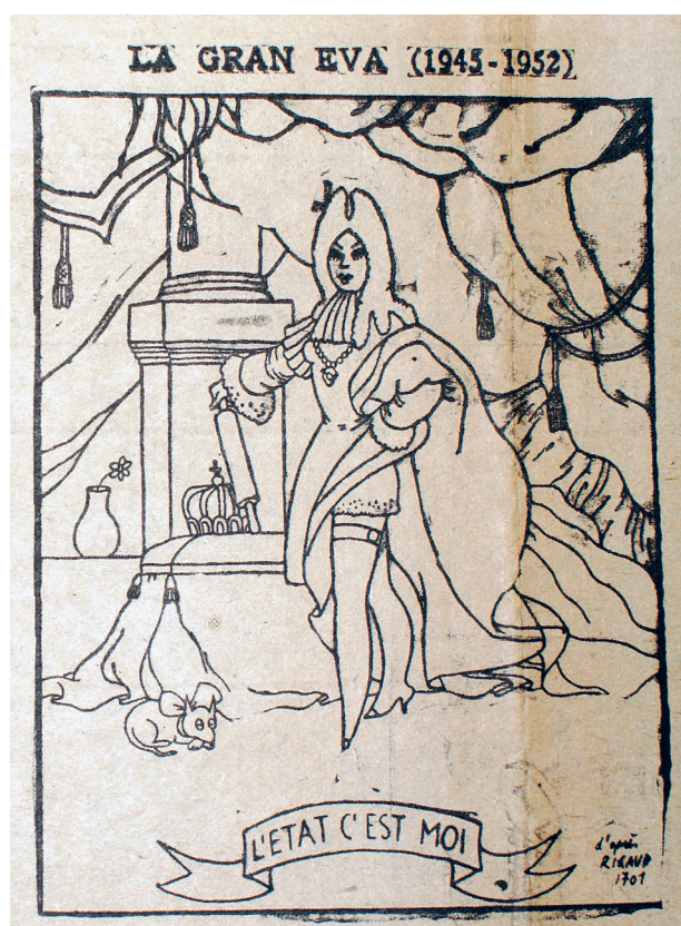
FIGURE 2: "La gran Eva (1945-1952)." La Vanguardia (circa 1952)

After the aforementioned shuttering of La Vanguardia , later Socialist publications, most notably Nuevas Bases , began to temper their attacks on the Peróns. Pictorial criticisms of the Peronist movement veiled their criticisms of Perón and Evita, replacing them with the figure of Rosas. Therefore, in the May 1 st , 1951 edition of Nuevas Bases we see a caricature of that 19 th century caudillo reading that the Pronouncement of Urquiza was not being commemorated. 55 Despite a decrease in the number of graphic criticisms of Perón and Eva, the Party kept up its denunciations of Peronist forms of celebration. Here we see their repudiation of a project that would have used executive power to order the minting of a golden coin with Perón's image on its obverse and the phrase "Nation, Just, Free, and Sovereign" inscribed on its other side. 56 Socialists also denounced official pronouncements that praised Evita. 57 The Party criticized a law passed in the province of Salta that stipulated that schools should erect