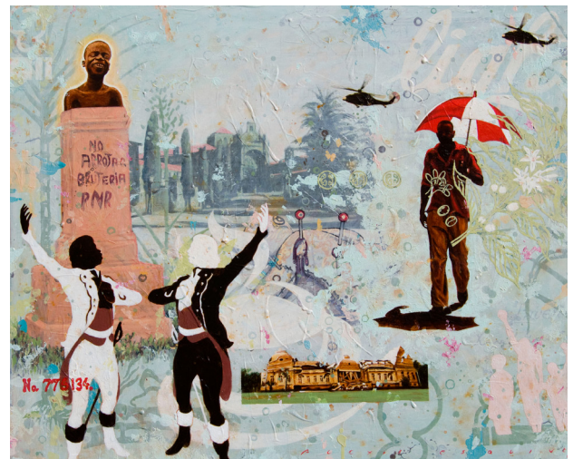
Republique Light 2012 Acrylic/Canvass 78 x 10 cm

In “Republique Light” I question the contradictions and symmetries between the colonizer and the colonized and I question the challenge, that is at once a trap and an opportunity, to be forced to defend your rights in the language of your oppressor. This may be seen as a contradiction and a dead end that condemns what some term today the “subaltern subject” to failure. I derived my inspiration by the story you tell in your book, Undoing Empire , concerning the Battle of Crête-à-Pierrot, a key chapter in the Revolution of Saint-Domingue in 1802. At that moment the French did not recognize the freedom fighters under Dessalines as citizens in equal standing. Yet, they trembled when they heard them sing the Marseillaise with great enthusiasm as they awaited certain death at the hands of the much superior force sent by Napoleon to reinstate slavery. As you say, there was a reversal of roles