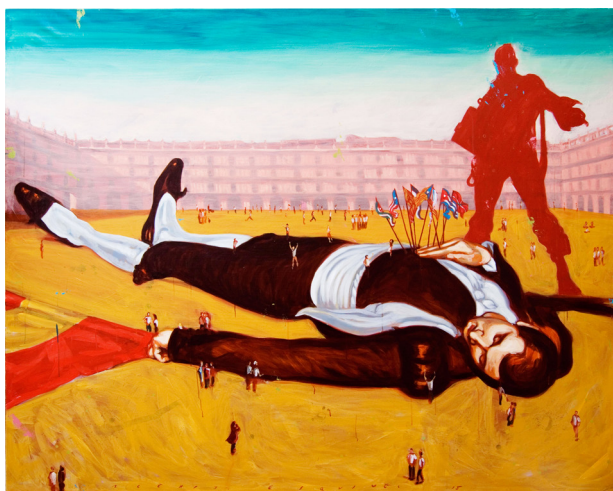
La muerte de Gulliver / The Death of Gulliver 2015 Acrylic/Canvass 190 x 240 cm

In the "The Death of Gulliver" I deal with the colonial heritage and the way it influences modern movements for self-determination as well as nationalist claims. I find Jonathan Swift's vision as an Irishman to have been quite