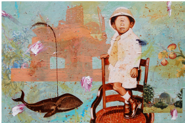
La profecía del cíclope / The Prophecy of the Cyclops 2012 Acrylic/Canvass 114 x 175 cm

AE: Yes, this work is very self-critical. It deals with the fatalist excuses that most West Indian peoples take for the truth, like the idea that the Caribbean countries lack natural resources to promote the development of prosperous and democratic nations. Several images point in that direction. There is the silhouette of the “Scarabeo 9”, the giant Spanish oil rig that failed to find oil off the coast of Pinar del Río. Lying under it, as in a deeper stratum, is the carcass of a whale spouting a jet of oil that moves through and over the silhouette of the rig. This is an allusion to the criticism made by Cuban intellectual Alberto Pedro who, in his play “Manteca” (Lard), suggested with great irony that Cuba could not have oil reserves because it had never had dinosaurs.